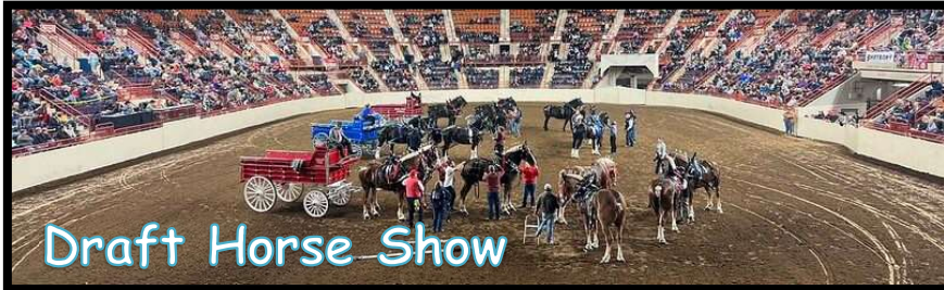
Draft Horse Show