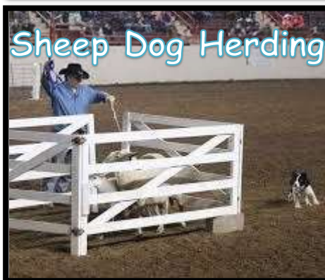
Sheep Dog Herding