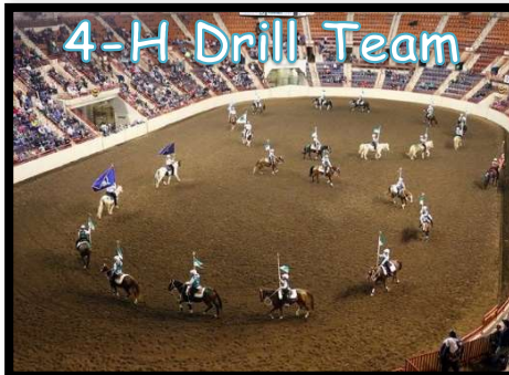
4-H Drill Team