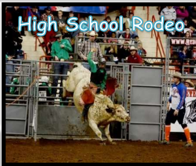
High School Rodeo