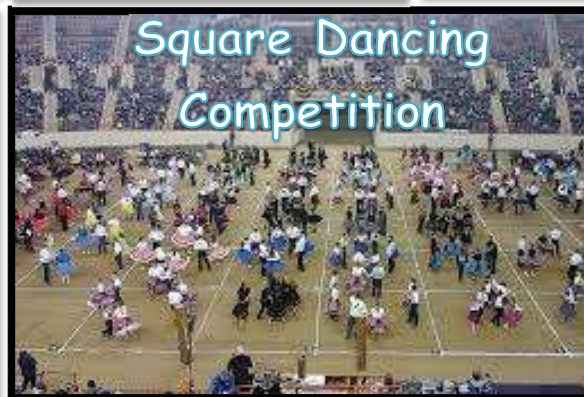
Square Dancing Competition